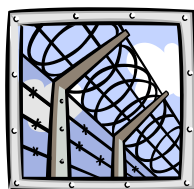
The Holy Spirit is working behind these fences and walls through P2P