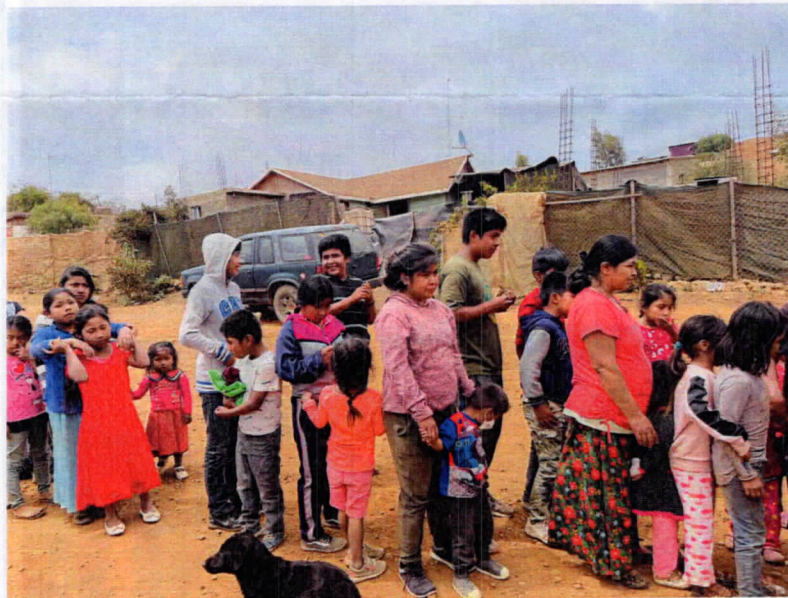
Men, women and children waiting to receive some food.