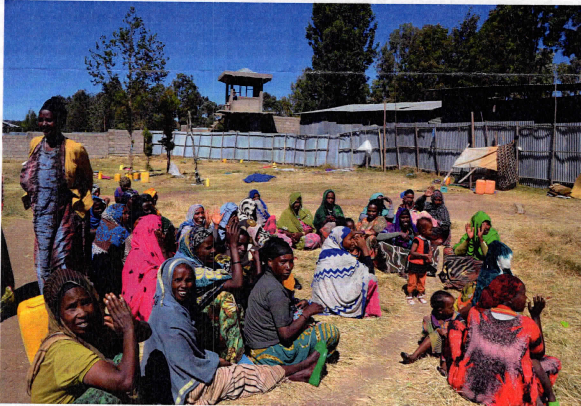
Women in a prison in Ethiopia.