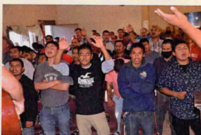
Men in recovery during the Thanksgiving service worshipping God.