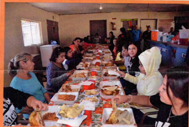
Women in the Rehab eating at the Thanksgiving banquet.