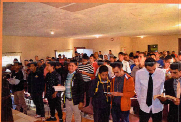
Men in the Rehab during the Thanksgiving worship service.

I AM VERY GRATEFUL to the people who supports me financially every month through the Pastors to Prisoners Organization. I couldn't be doing the missionary work that I am doing without your help. THANK YOU! — I pray that God will reward you greatly for your generosity.