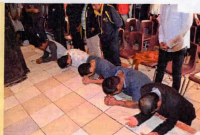
Men praying at the altar.