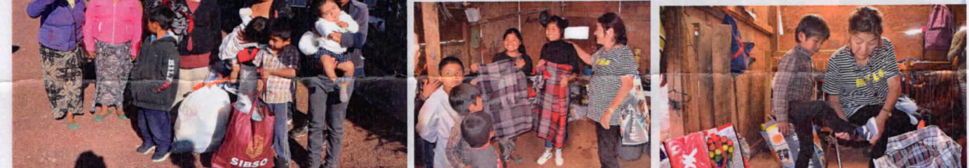
Pregnant women and some with babies receiving baby clothes for their children.