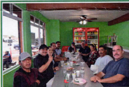
The leaders of the Rehab eating tacos at Pericos in Camalu.