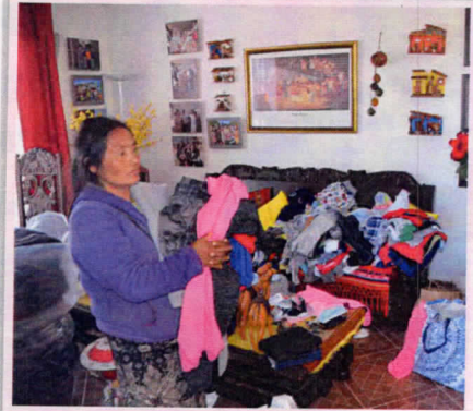
This woman asks for your help. Her husband died last Friday leaving her with six orphan children. She limps from one leg and is difficult for her to work in the fields picking up strawberries. They need blankets, shoes, jackets and food. Thank you.