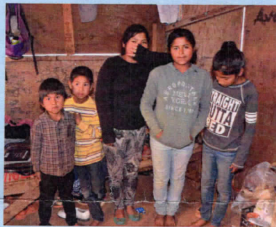
These children need shoes sizes 12, 1, 3.5, 4 and 3. Thank you

I thank God that I was able to buy fifty new blankets at a price of $140 pesos each, which is the equivalent to $7 dollars each. I distributed them to the poorest families and they went out very fast. I am grateful to all the people who have blessed me with their finances and donations enabling me to bless others during this Christmas season. Thank you!