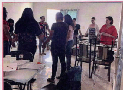
God continues working in the lives of the women in rehab. Please pray for them.

NOTE: I am grateful to all the people who supports me with their finances through the Pastors to Prisoners Organization and others with food, clothing and shoes for the families in Las Aves. Most of all, thank you for your prayers. I cannot name you all, but God knows your name and I pray that the Lord blesses you abundantly for your generosity! Thank you!