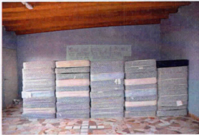
We are very grateful to Calvary Chapel Tehachapi for providing the funds to buy these mattresses for the men's home. Thank you!