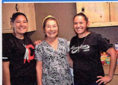
Here with two of the girls from the rehab cooking for the children's breakfast on a Friday morning.