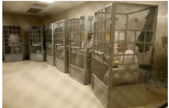
I was in prison, and you came to Me... Matthew 25:36