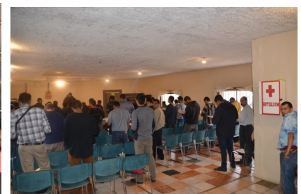
Men at the rehab.