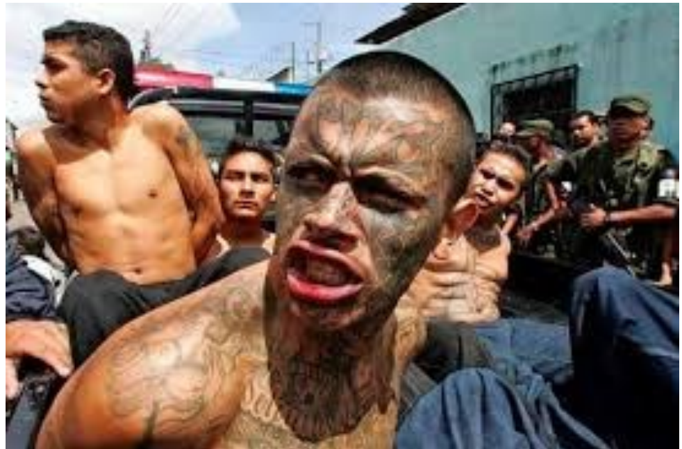
Photo of men in a prison in San Salvador during a riot.

Soon I will be able to provide a Bible study in Las Aves on Saturday mornings for the children and their parents. Praise God!